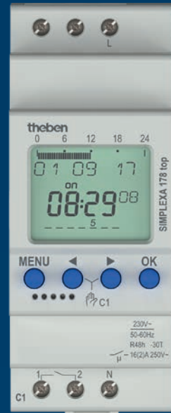
SIMPLEXA 178 top