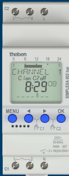
SIMPLEXA 602 top