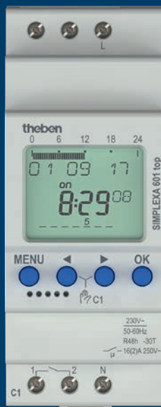
SIMPLEXA 601 top