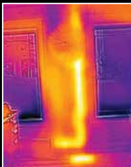
Warm Pipe in Wall