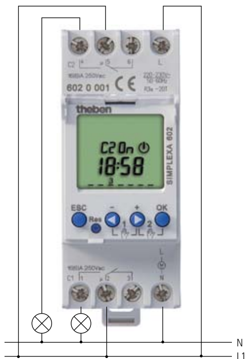
SIMPLEXA 602 – Connection diagram