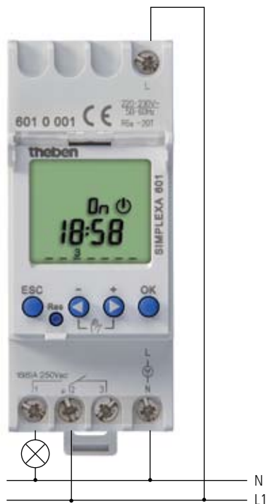
SIMPLEXA 601 – Connection diagram